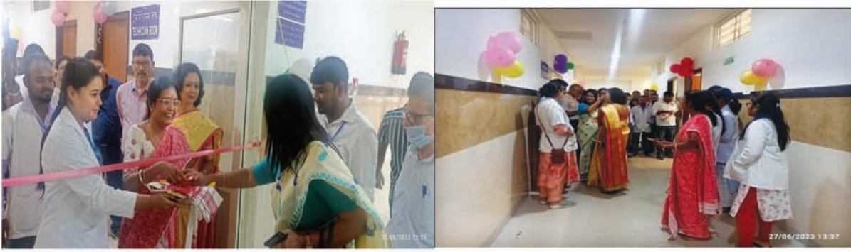
Inauguration of new CCL in the new Hospital Building on 28.06.2023