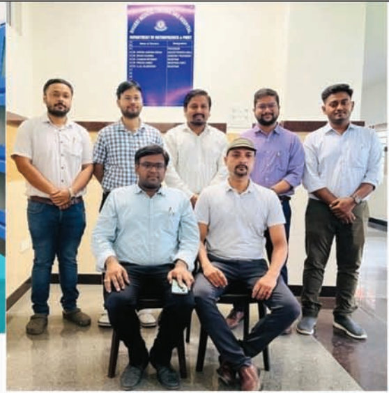
Department of Orthopedics