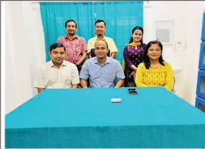
Department of Obstetrics & Gynecology