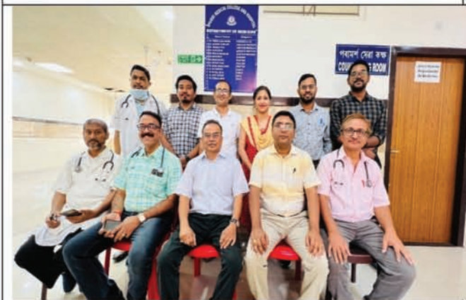
Department of Medicine