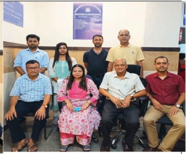
Department of Ophthalmology