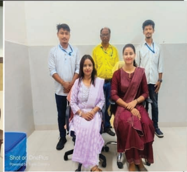
Department of Dentistry