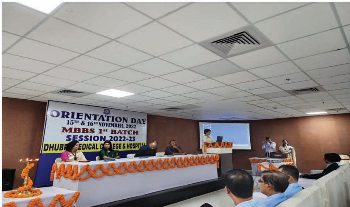
Orientation Day of First Batch MBBS DMCH, 15/11/2022