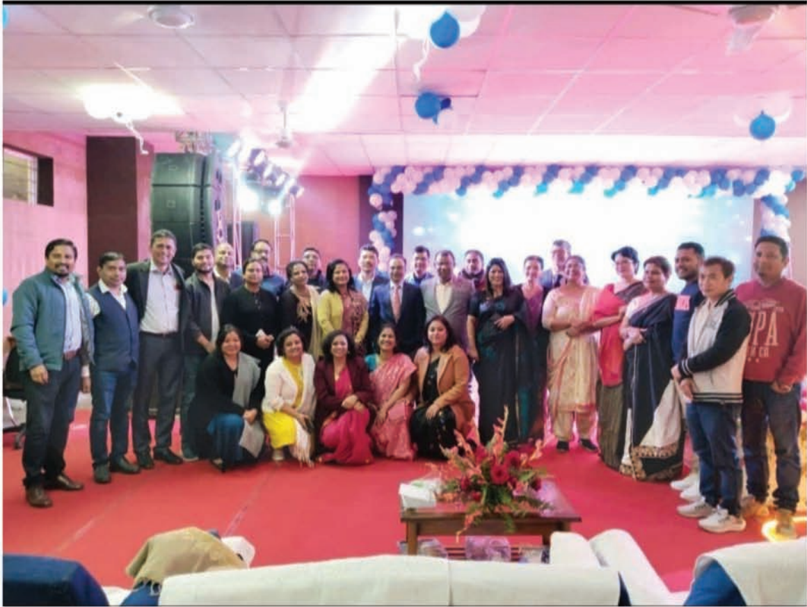
Faculties of DMCH