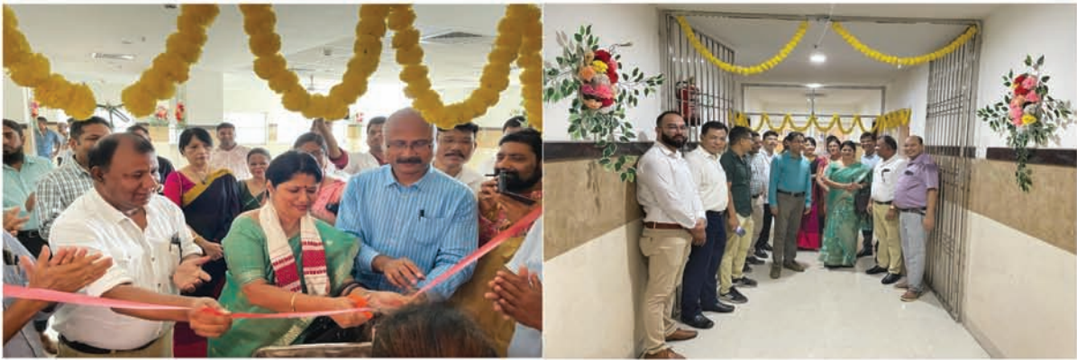
Inauguration of new Blood Bank in the new Hospital Building on 1.09.2023