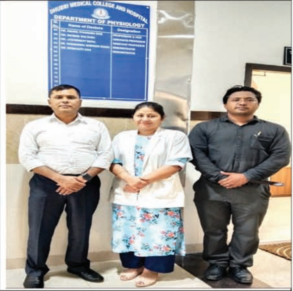
Department of Physiology