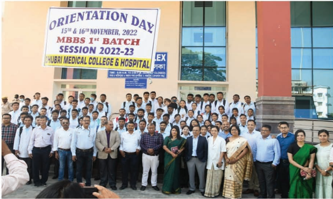
First Batch MBBS Students with Faculties