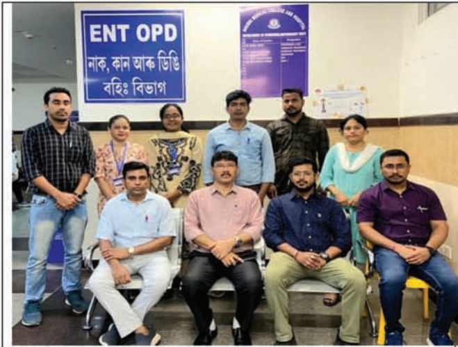
Department of Otorhinolaryngology