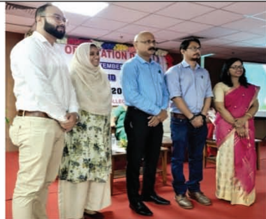
Department of Forensic Medicine