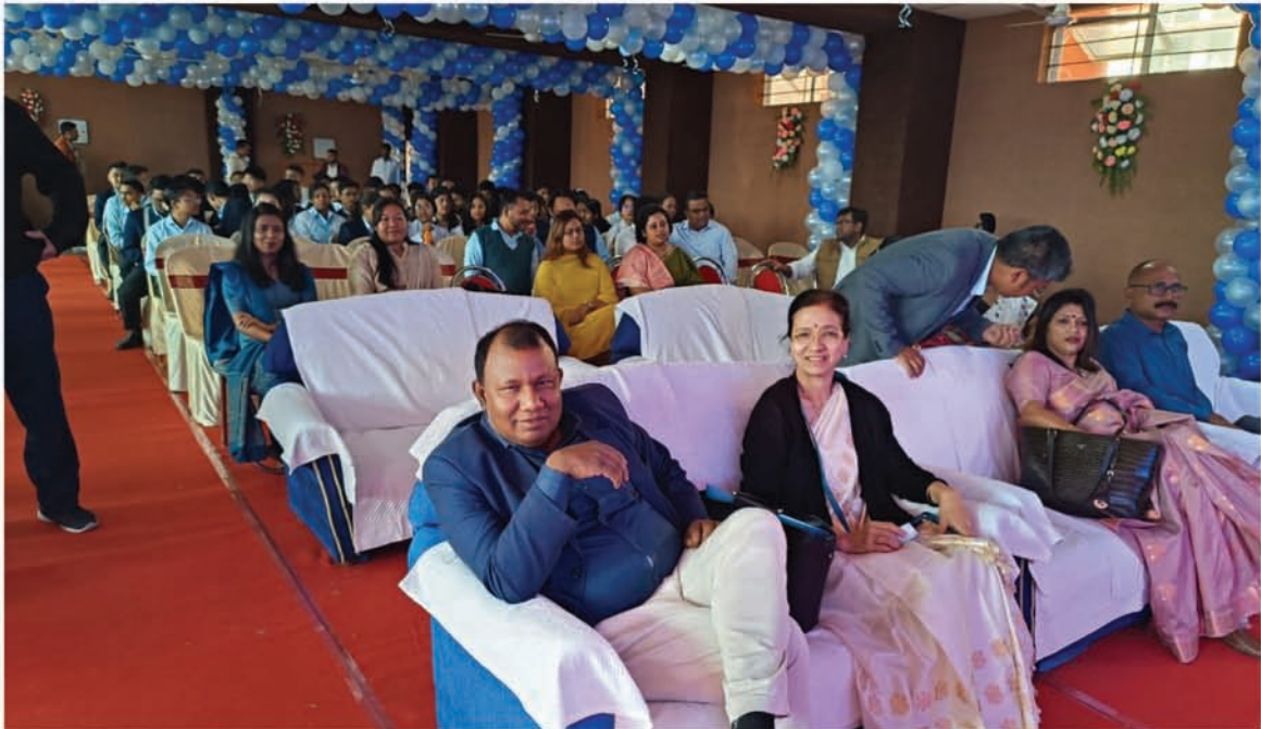
On the Day of Fresher Soicial of First Batch