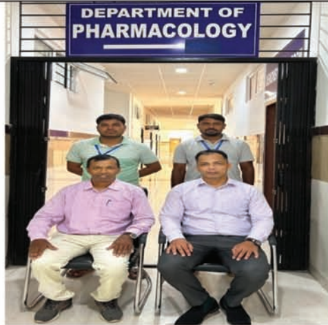
Department of Pharmacology