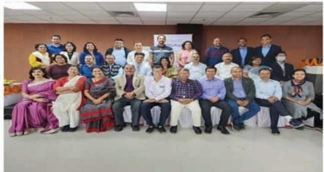
GCP Workshop held on 16 th Nov. 2022