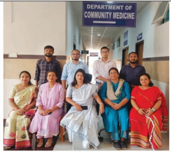
Department of Community Medicine