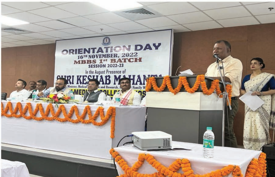
Orientation Day of First Batch MBBS DMCH, 16/11/2022