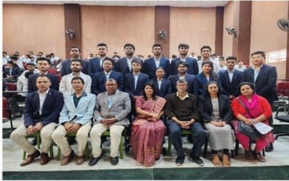
With College Students Union