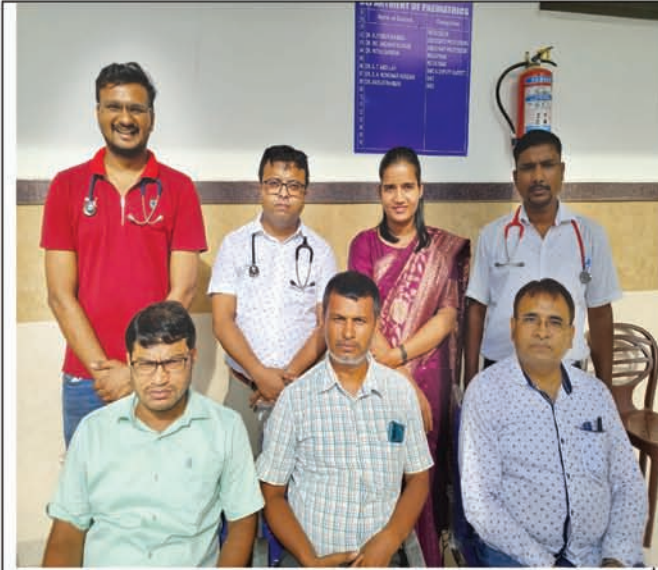
Department of Pediatrics