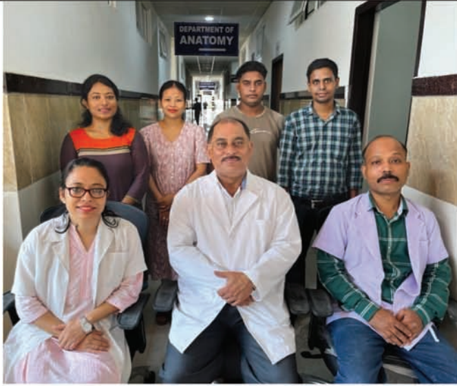
Department of Anatomy