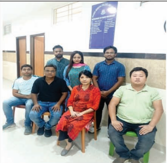
Department of Anesthesiology