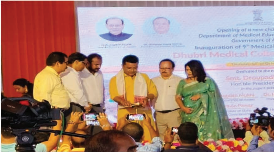
Opening Ceremony of DMCH at Dhubri