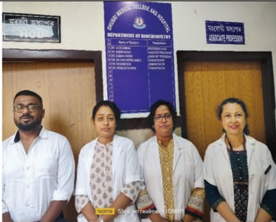
Department of Biochemistry