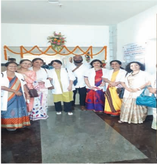
Inauguration of OPD: DMCH