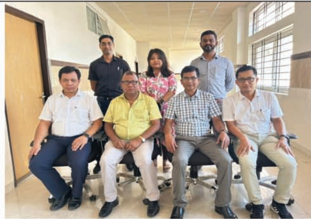
Department of Pathology