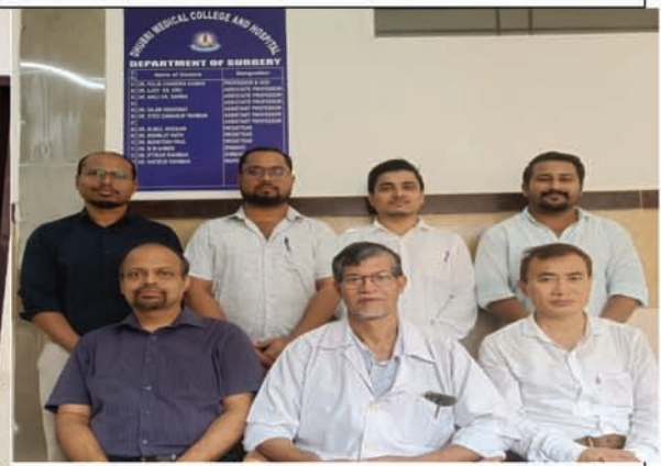
Department of Surgery