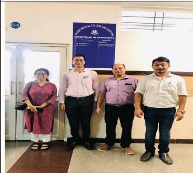
Department of Psychiatry