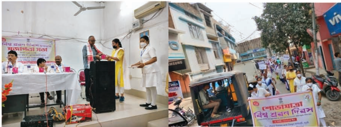
Observation of World Hearing Day on 3 rd March 2023 by NPPCD, Dhubri & Dept of ENT